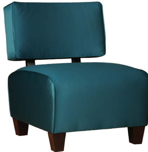
Body Fabric: Robert Allen, Glam Tourmaline