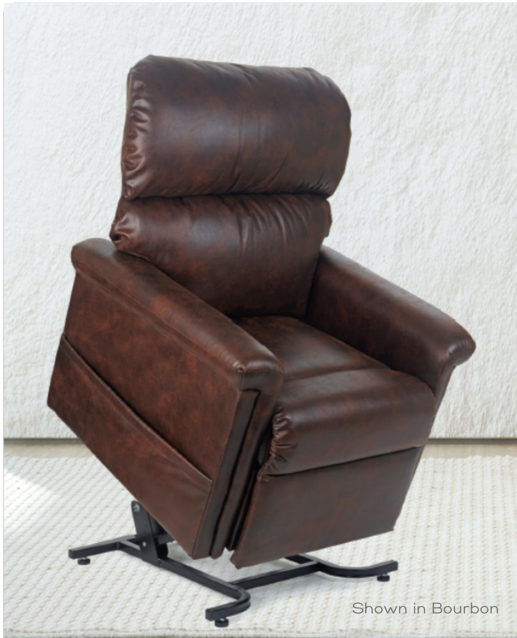
Shown in Bourbon