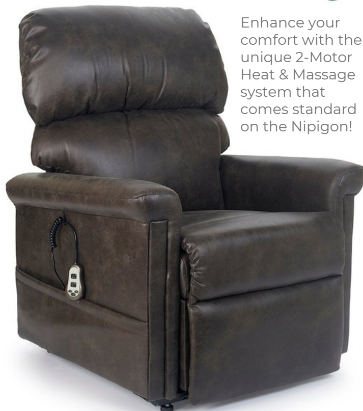
Shown in Smoke

Enhance your comfort with the unique 2-Motor Heat & Massage system that comes standard on the Nipigon!